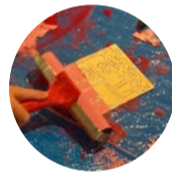
Friday 19 Jan