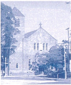
Holy Family Church 2 Highfield Rd, Lindfield